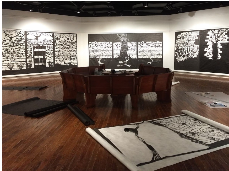
A Secret Garden