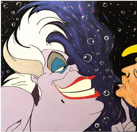
Take His Breath Away, 2ft by 2ft , Acrylic on Wood

series, most of the paintings had Spanish names. And the numbers meant something to me at a special time.