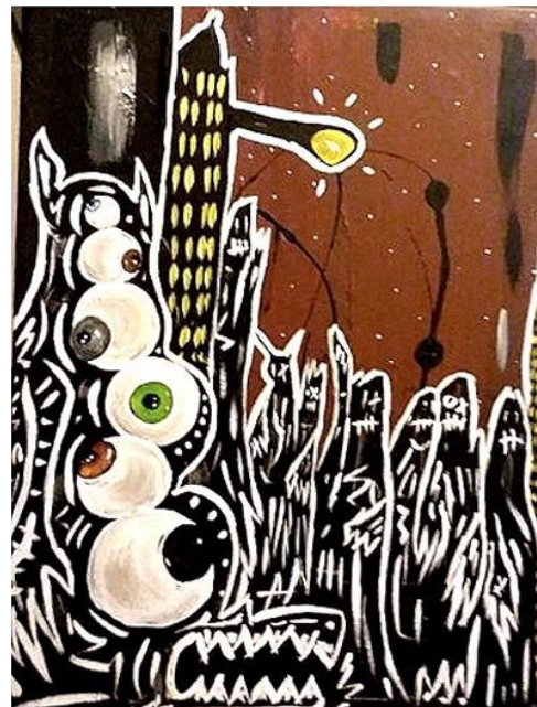
Invasion Insane collaboration with @picassoismyrealname

LoL. I try to be heavily influenced by older artists who have passed. Frida. Basquiat. Picasso. Kooning. Yayoi! I even painted my favorite artists because I could not stop speaking their into existence while I paint.