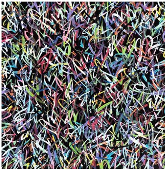
La Gloria, 18x18, Acrylic on Canvas

It's been tricky but I've built my art brand online so business is as usual. Not having shows where many people can see my work personally is the hard part. I've sold through my heart series and my curly series so now I'm back at the drawing board. And California still hasn't seen my work. All we have right now is social media.