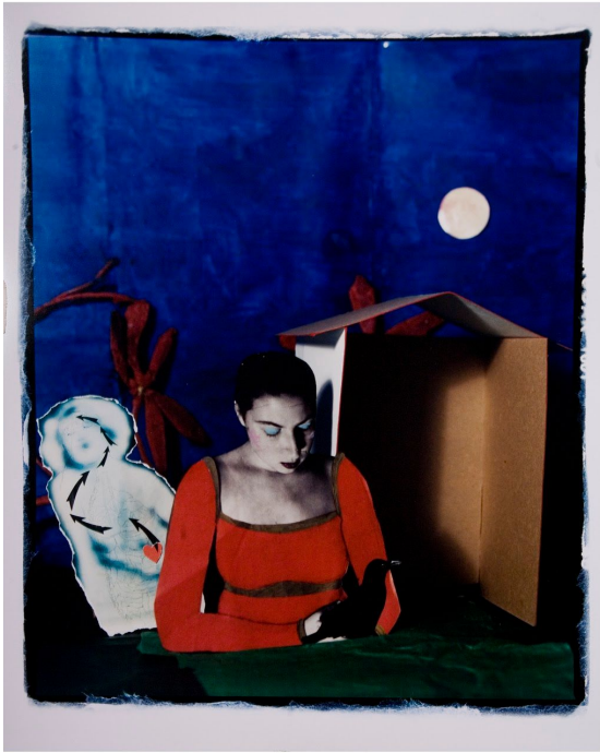
~Chrysalis (Summer) self portrait