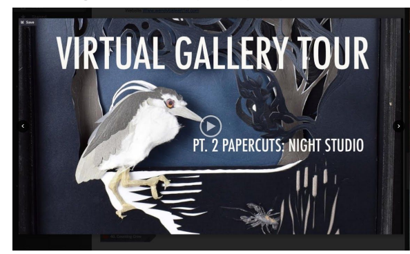
Gallery Tour — Pt 2: Night Studio

Here at Sandhill Designs Studios we are lucky to have a lot of studio spaces. We converted the attic of the garage into my cut paper studio. It's great for smaller projects, but if I want to work large—or need great ventilation— I use a section of the barn Bill uses as a wood-shop. We also have a little photo studio set up in a spare bedroom. This was a boarding house in the 1800's so there are a lot of bedrooms. I waffle between being hyper-organized (losing everything) and being surrounded by stacks of paper (knowing where every scrap is piled).