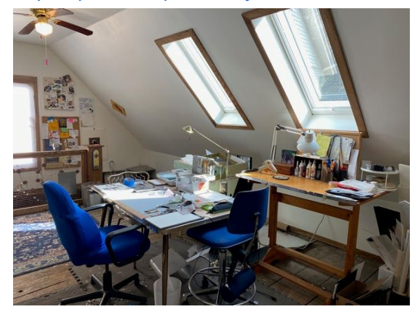
The paper cutting studio above the garage.