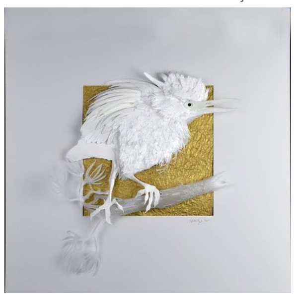
Green on Gold, 24 x 24 Private Collection

I retired from the corporate life on April Fool's day 2019. Before that, I did a lot of work in my studio at night, hence the reoccuring "Night Studio" theme I play with. I used the art to decompress after the stress of the job.