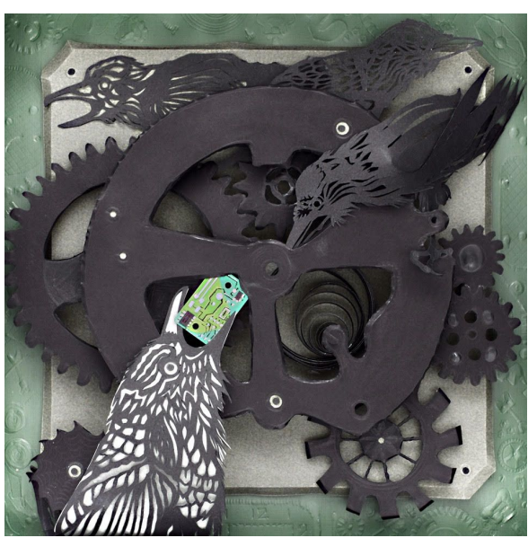
The Mechanical Circus" at 3rd on 3rd Gallery