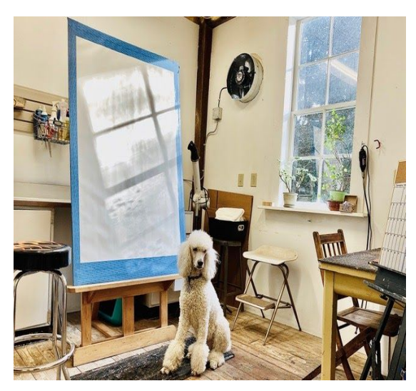
Charcoal Studio in the barn, which has a huge fan for ventilation (also doubles as Poodle Parlor)