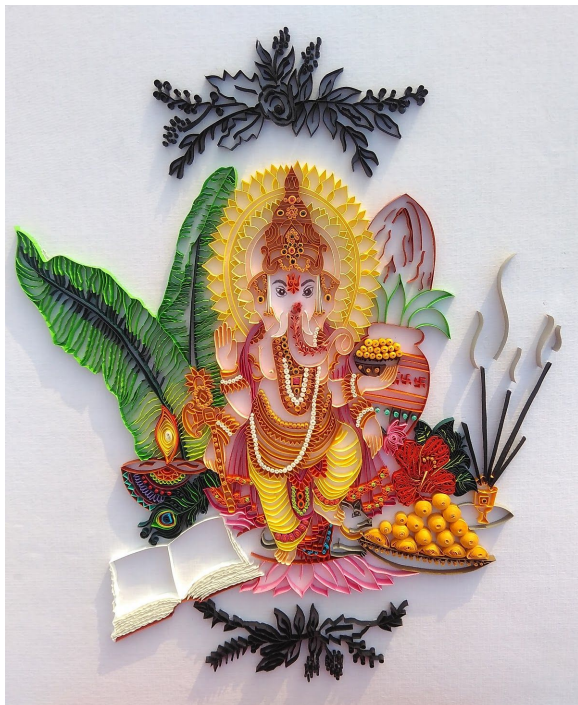
Lord Ganesha (it's picture of ganesh ji and ganesh ji is an Indian god)

In making of Paper quilling takes a lot of time and Working as an individual and keeping balance is tough. Think about new ideas, manage social media, Marketing strategies and work on art to manage all these things for which I create schedules.