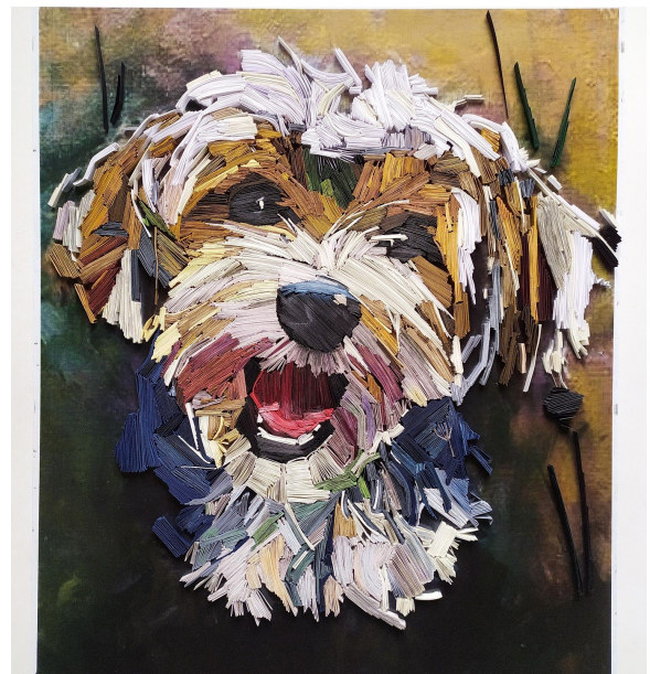
Quilling Havanese Portrait

So, I never prefer to work on any single subject.